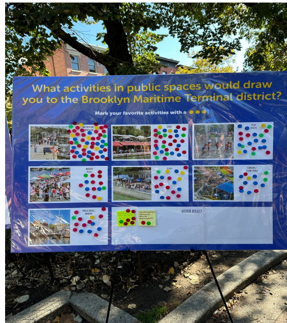
Completed boards after Cobble Hill Park engagement event